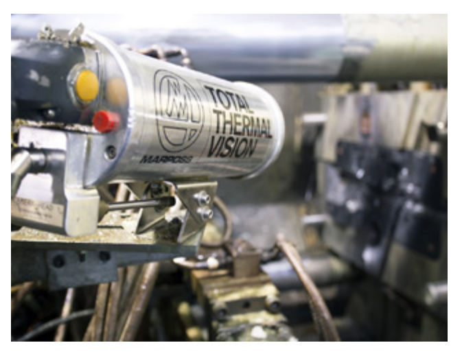
A detail of the TTV thermocamera case