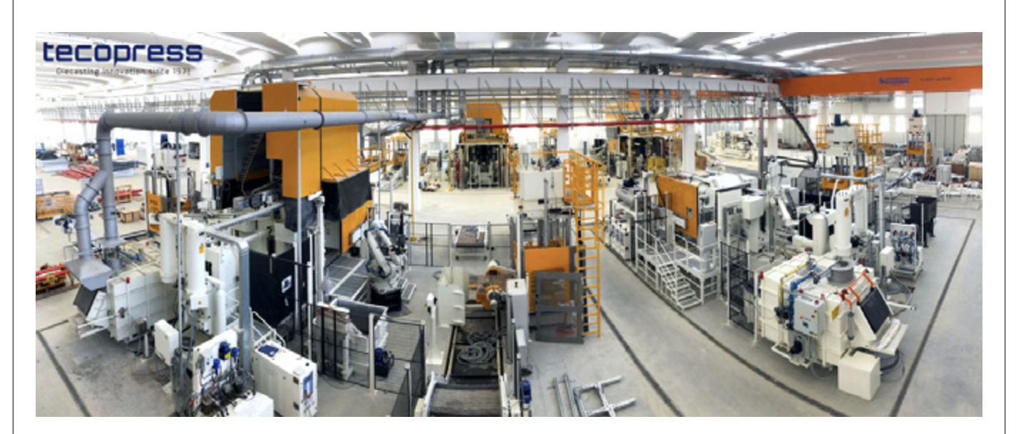
A part of the Tecopress Production Plant

TTV has enabled Tecopress to reduce die cast flaws and increase moulds lifespan