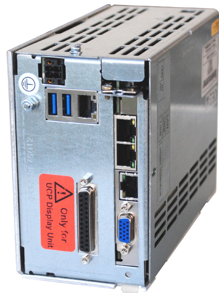
Illustration similar – variant: CBU-1.2 CTMV6PN