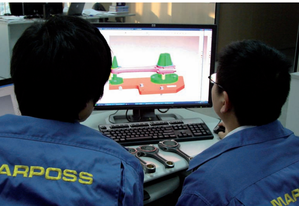
Mechanical technical dept